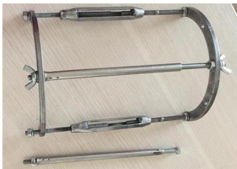
Figure 1. Distraction system of the external fixation apparatus according to the Ilizarov type.

The half-rings of the Ilizarov apparatus were used as supporting elements. [16] The surgery was performed under general anesthesia. In the nadacetabular region of the pelvis and in the upper third of the thigh, 2 rods were held in different planes, the device is installed and fixed on the supporting elements of the external fixation apparatus (Figure 3).