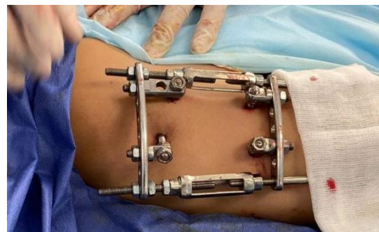
Figure 2. Intraoperative photograph during the installation of the distraction system of the external fixation apparatus on the hip joint.