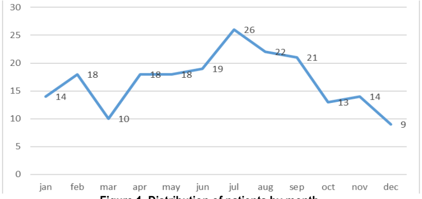
Figure 1. Distribution of patients by month.

The most common cause of trauma (76.8%) was falling, while the least cause of trauma was non-vehicle traffic accident (2.5%) (Figure 2).