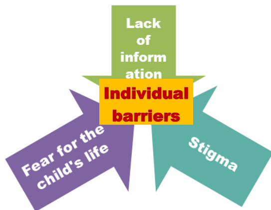
Figure 2. Individual barriers.

Many women in labor perceive the nursing service as a service that provides assistance only to children, but not to parents, especially in case of depression. Physical symptoms (back pain, problems with breastfeeding, the consequences of a difficult birth, cesarean section, etc.) are perceived as the main indicator when referring to specialists. Indecisiveness in parturient women in recognizing depression and a tendency to minimize symptoms is the main barrier to identifying PDD. Also, studies by Kim J, Buist A. indicate that women take psychological fluctuations for granted. Most believe that this is a normal body reaction after childbirth [22].