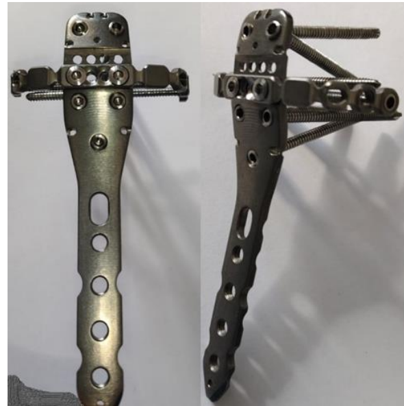
Figure 1. Picture of a new device for fixation of proximal humerus fractures.

using crutches. The third load was rotational, with a force of 200 N (Figure 3).