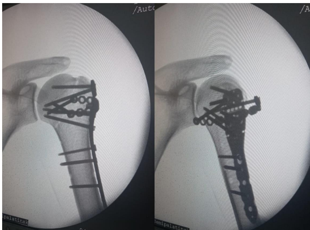
Figure 4. X-ray of the patient’s shoulder joint after osteosynthesis with a new device.

surface of the humerus and the bone was drilled through the holes in the plate with a drill. Locking screws were inserted through the holes and the fracture fragments were fixed. Then, through a small hole in the upper part of the plate, an arcuate, curved, narrow plate-like element with screw holes was fixed. Through the holes of this plate, screws were inserted into the head of the humerus in an anterior-posterior direction, and the fracture fragments were additionally fixed. X-ray control was performed. The wound was treated with antiseptic, sutured with a layer, and a drainage tube was left. 3 days after the operation, passive movements of the shoulder joint were started using the “arthromot” device. The operated arm was hung around the neck with a soft towel, and active movements were allowed after 3 weeks (Figure 4).